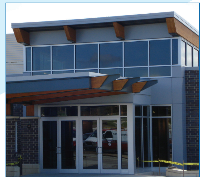
Exterior Architectural Beams