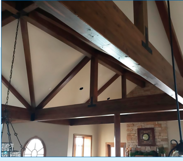
Interior Architectural Beams