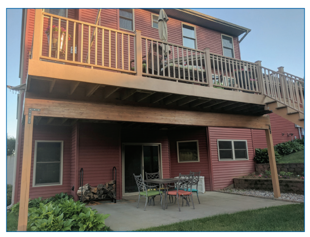
Treated Glulam Beams gives you an unobstructed view.

Treated glulam beams are made from Southern Yellow Pine or Douglas Fir. The beams are then treated to resist severe weather, insects, decay and sunlight. The beams are strong and attractive. Treating options include MCA, CA, CCA or Envirosafe Plus.